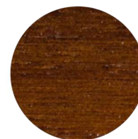
TINTO NOCE WALNUT STAINED