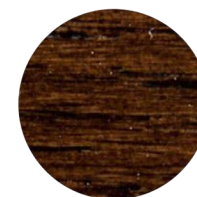
TINTO NOCE MOKA MOKA WALNUT STAINED