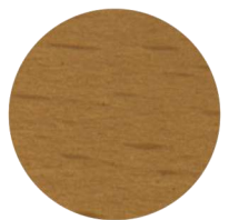
FAGGIO T. ROVERE OAK STAINED BEECH