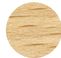
FAGGIO NATURALE NATURAL BEECH