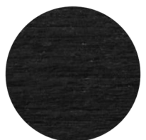
TINTO NERO BLACK STAINED