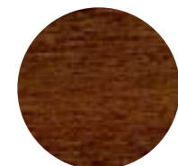
NOCE MEDIO MEDIUM WALNUT