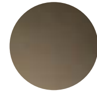
NERO NICKEL BLACK NICKEL