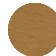
ROVERE NATURALE NATURAL OAK