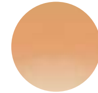
RAME LUCIDO GLOSSY COOPER