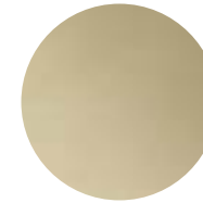
ORO LUCIDO GLOSSY GOLD