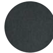
NERO OPACO MATT BLACK