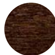
NOCE SCURO DARK WALNUT